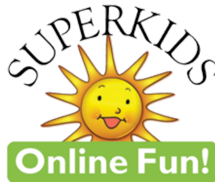
Interactive Library Books for Unit 9 Online games for sorting by letter-sounds, decoding, and encoding