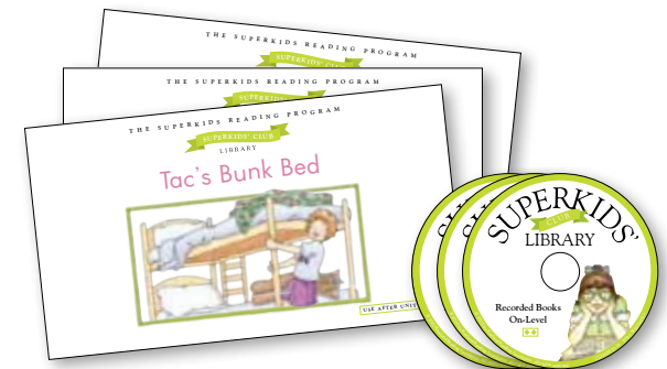
Leveled Library Books for Unit 9 and CDs