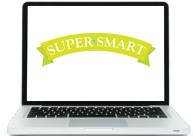
Super Smart interactive read-aloud for Unit 9